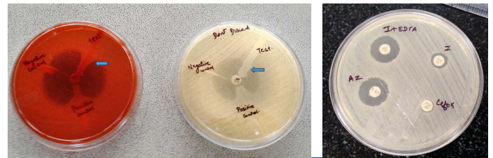
[Table/Fig-1]: MHT done on MacConkey Agar and on Muller Hinton agar. The arrow indicates indentation indicating a positive test result. [Table/Fig-2]: Combined Disk Test for detection of Metallo-Beta-Lactamase Production.

For Carbapenemase production, MHT done on MHA had a sensitivity of 40.0%, specificity of 89.7%, Positive Predictive Value (PPV) is 10/13 = 76.92% (probability of test showing positive will be carbapenemase producer). Negative Predictive Value (NPV) is 26/41 = 63.41% (negative test will rule out carbapenemase